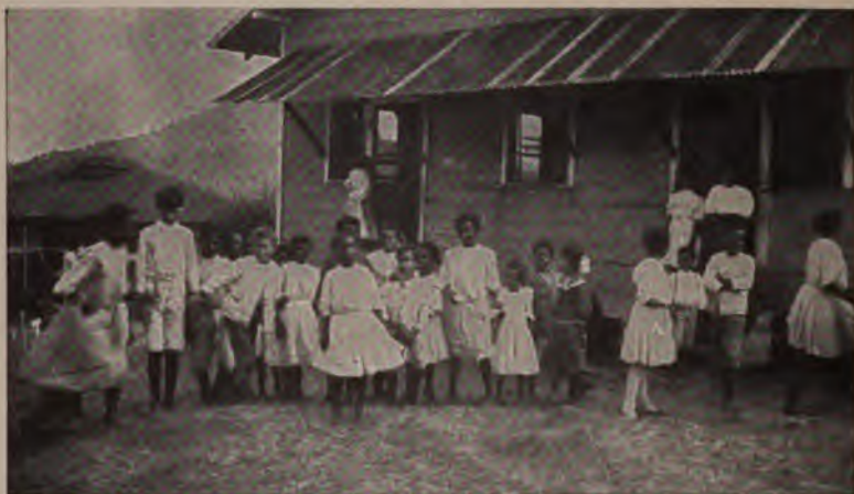
An I. C. C. free public school for non-whites